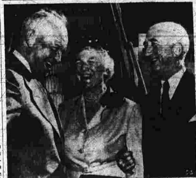
Gen. Dwight D. Eisenhower, left, and Gov. James F. Byrnes of South Carolina, right, and Mrs. Byrnes meet again as the Republican presidential nominee arrived in Columbia, S. C., for campaign speech. Byrnes, a life-long Democrat, said recently he would support Eisenhower.